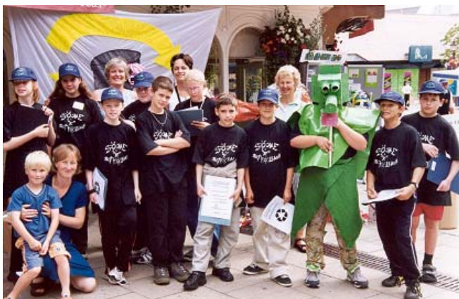
Waste minimisation summer school

GLADE works in partnership with the Department for International Development, OXFAM, Christian Aid, UNICEF and education providers in South West England.