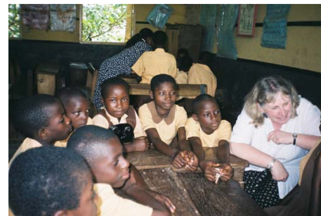
Linking lives, linking lessons