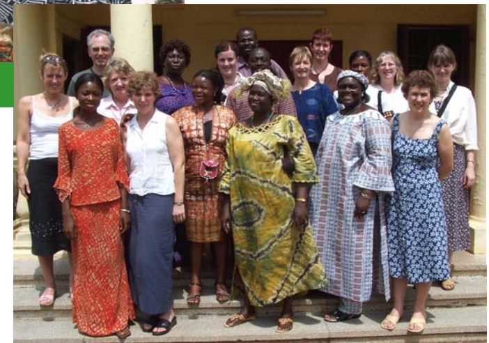
Teachers' study visit to Ghana

Wood already touched by fire is not hard to set alight African proverb